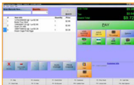
Retail Invoice Screen