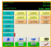
Touch Screen Lookup