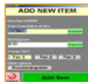
Add Items on the Fly